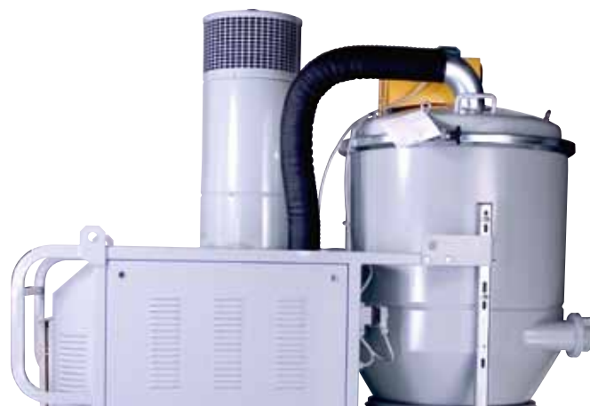
Air outlet diffuser