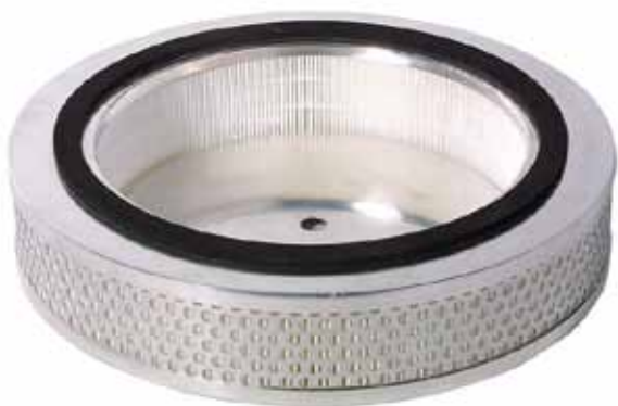
Upstream absolute filter

Visit the site www.nilfisk-cfm.it for a free accessories catalog, including option and separators for your vacuum: you'll find the perfect solution to meet your own specific requirements.