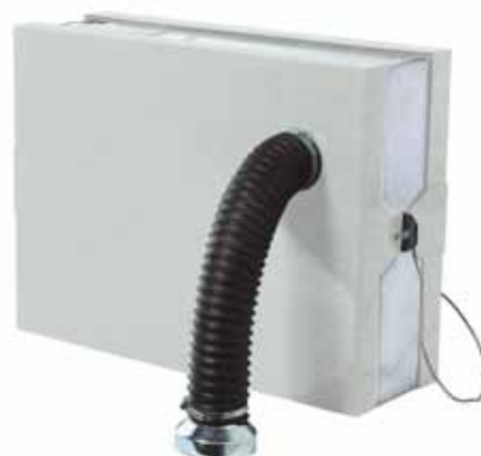
Downstream HEPA filter