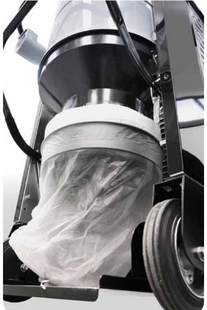
▶ Longopac® "endless" collection system