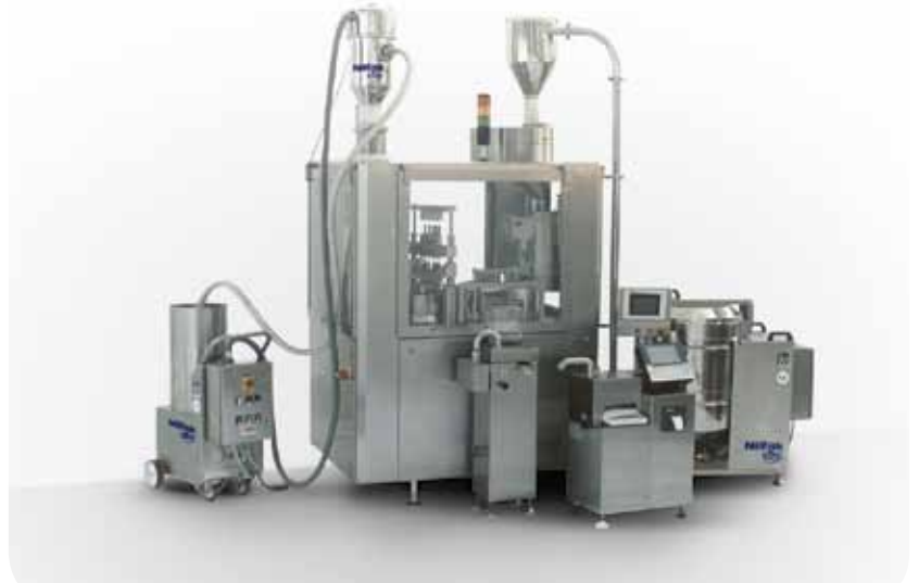
▶ Pneumatic conveyor (left) and capsule pusher (right), in a pharmaceutical company

Pneumatic conveyors are designed to transport powders and granules from one point to another without changing the mix. These systems are often used to feed automatic machines. The ATEX versions abide by the safety standards used in food production and the chemical-pharmaceutical industry.