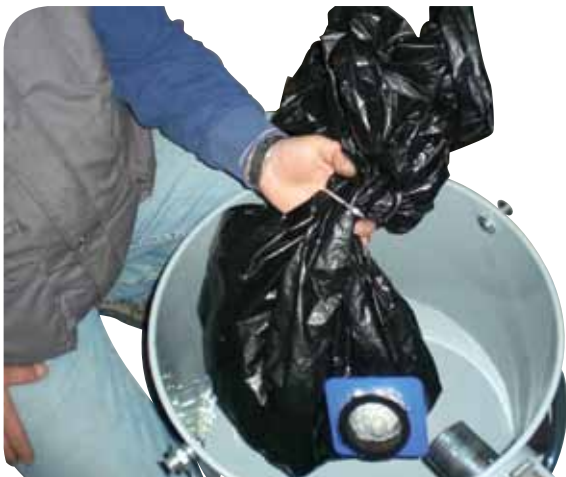
▶ Safe Bag filter

For more information, contact Scrubvac sales 01309 676796 sales@scrubvac.co.uk