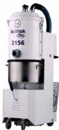
Three-phase up to 4 kW