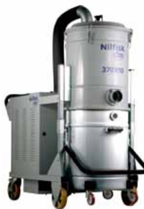
7.5 kW three-phase up to 18.5