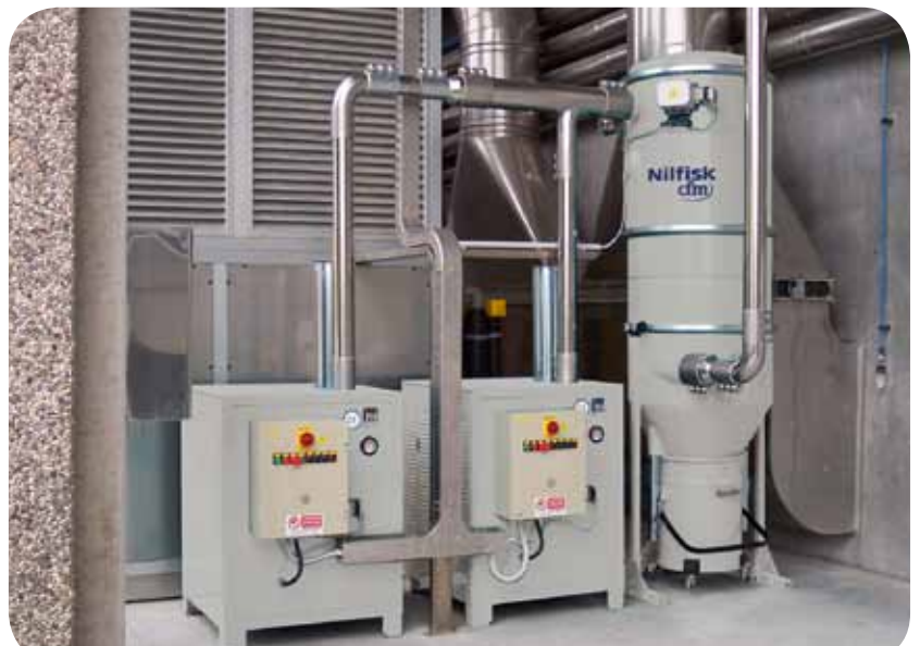
▶ Centralized vacuum system in a chemical company: 2 vacuum units, 1 filter silo

Centralized vacuum systems are the ideal solution for vacuum applications required in several places simultaneously, and in large environments that may have very different features. ATEX certified systems are often the only choice for large industrial production.