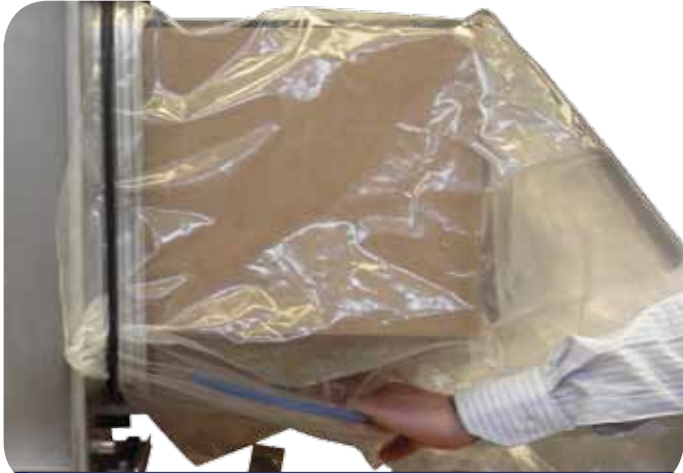
▶ Bag-In Bag-Out filter system